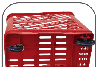
50 and 75 mm Travelator Plastic wheel