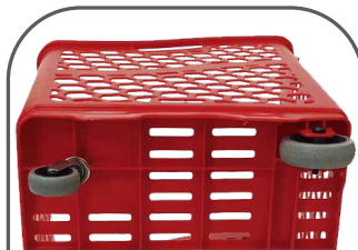
50 and 75 mm rubber wheels